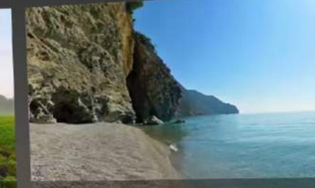
Beach for yourself